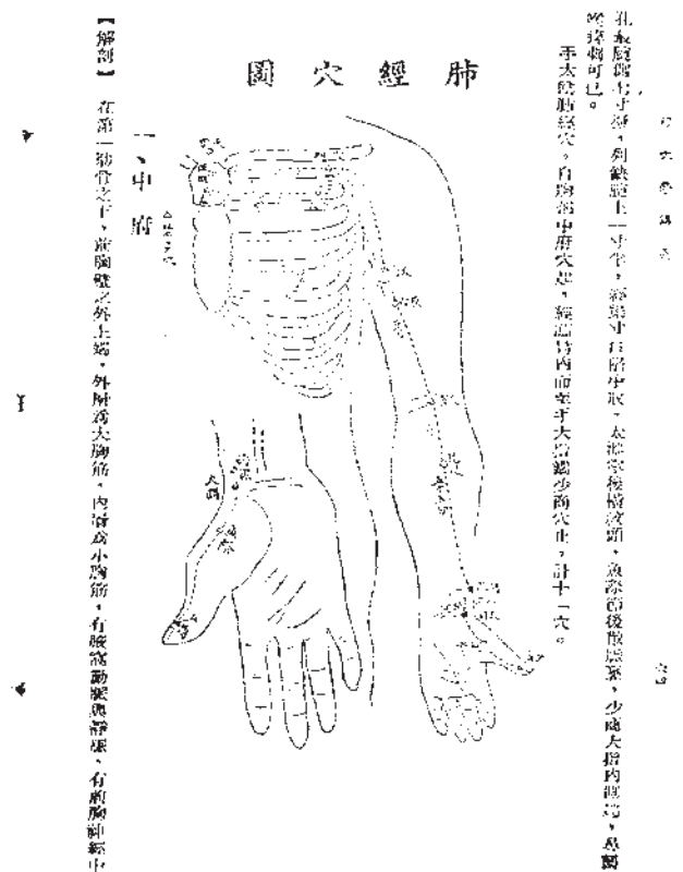
Image 2: A picture of the Lung Channel from A Study of Chinese Acupuncture and Moxibustion by Cheng Dàn'ān

For taxation strangury, there will be onset of dribbling urinary block after the person has endured taxation, the body will be exhausted, there will be frequent pain when urinating and distension radiating from the abdomen to the anus. If the taxation is mild there will be slight strangury, but if the taxation is severe the strangury will